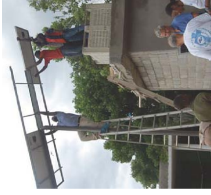
Installation of solar panels in Haiti

Ferncliff Camp & Conference Center near Little Rock, AR