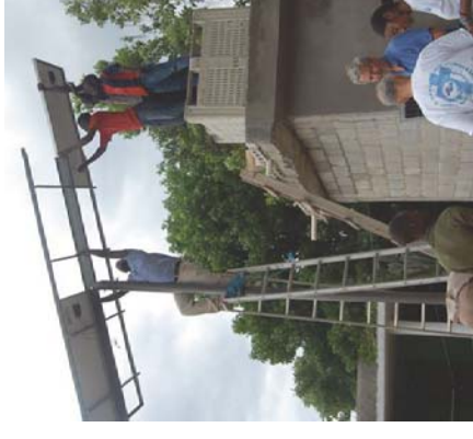
Installation of solar panels in Haiti

Solar Under the Sun is designed to provide the necessary training to churches and organizations to enable them to install solar power in places of great need. Solar groups partner with nonprofit communities to help them meet community needs while becoming better stewards of God's green earth.