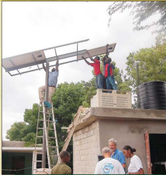
Installation of a solar panel in Haiti.

Solar Under the Sun is initially working in partnership with the Synod of Living Waters to augment the Living Waters for the World (LWW) program. LWW constructs simple but effective water treatment facilities. Most of these facilities, however, get their electricity from gasoline-powered generators. The ability to operate for even a few hours a day on solar-produced electricity saves money on fuel and protects against shortages. This also spreads the use of clean, renewable power—an outreach in and of itself.