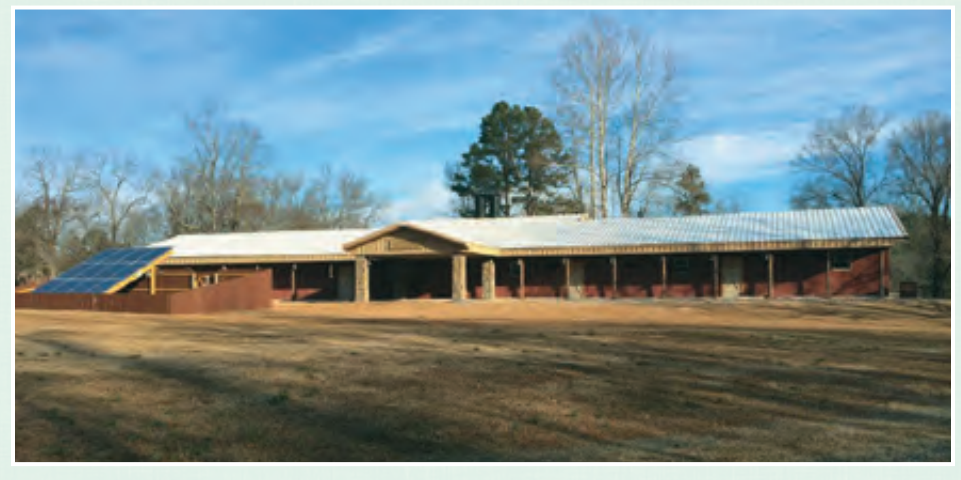
This beautiful building is ready for the next Solar School Graduates. Join us in May & September.

No home for Solar School would be complete without solar power. The whole building is powered by