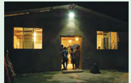
The church in El Horno, Honduras showing off their new Solar Under the Sun energy system.