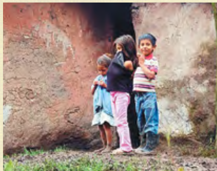
Children playing outside a home in Las Glorias, one of the communities waiting for solar power.

The people of Honduras are especially excited for this type of work, and many communities have come to us saying that they will do whatever they can to collaborate. A few communities